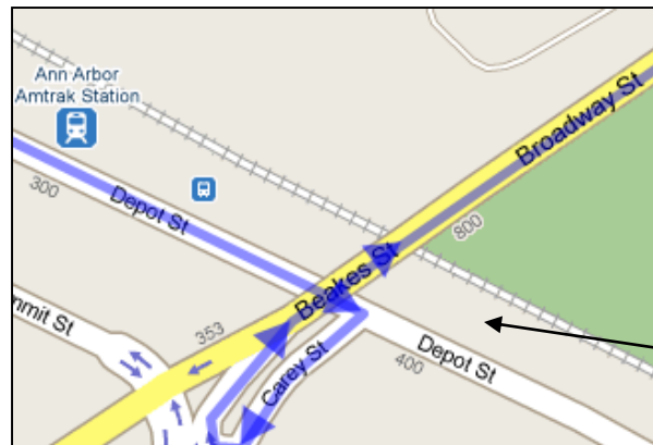
Turn onto Broadway